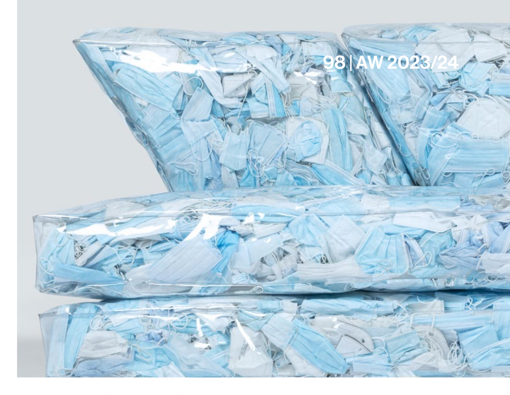
Tobia Zambotti | COUCH-19 | Discarded disposable masks and recyclable crystal PVC