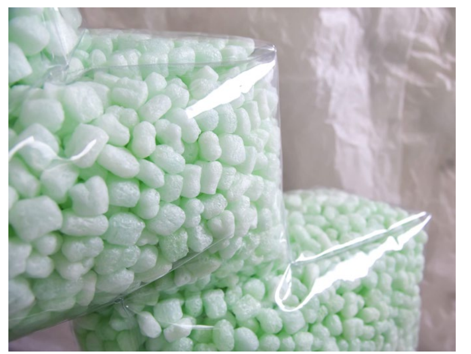
Jóna Berglind Stefánsdóttir | PLUS PLUS The Optimistic Shelf | Upcycled styrofoam and vinyl, cotton thread | Photo Anna Gudmundsdottir © ADORNO

Activism that confronts our approach to waste drives projects where surplus materials are reused as stuffing fibre. Jóna Berglind Stefánsdóttir upcycles Styrofoam in the vinyl PLUS PLUS Optimistic Shelf. Takahito Iguchi quilts lint and fibres leftover from textile testing facilities in his collection Decomposition, and the WASTIC JACKET by Sally Northman is made from surplus textiles and building plastic. Emphasis is on transparency through design to expose the sheer volume of waste created.