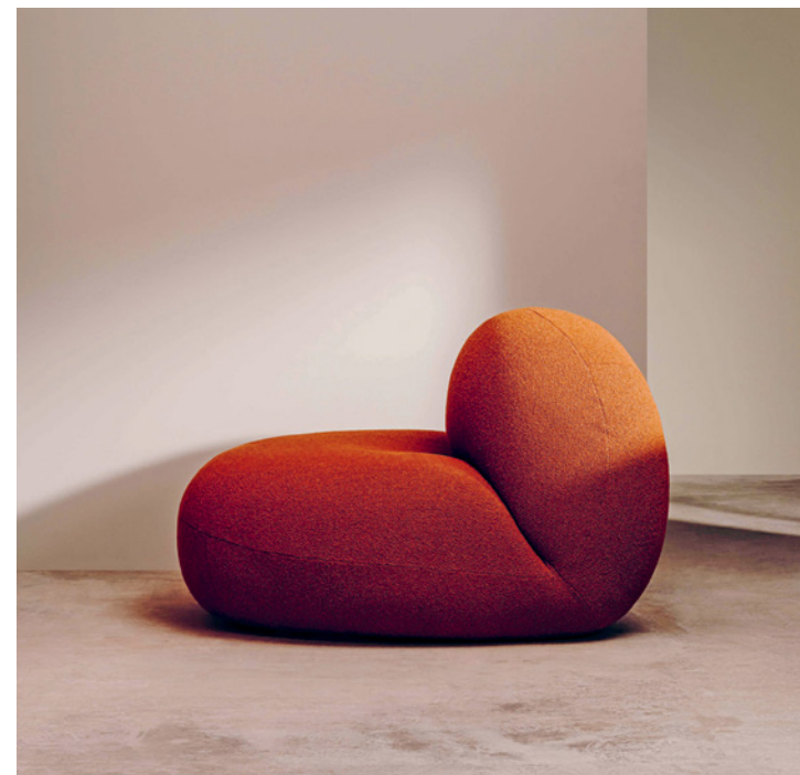
One of the latest products to emerge from Patricia Urquiola's long-standing collaboration with ANDREU WORLD, the NINA LOUNGE is a curvy, generously proportioned chair that references the bulbous shapes popular in 1970s design. Materially, however, it has its feet firmly planted in the 2020s, with a structure made from Andreu World's proprietary 100 per cent Pure ECO® thermopolymer. andreuworld.com