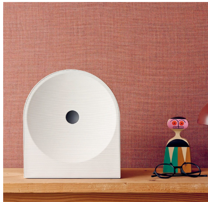
SAMSUNG's MUSIC STUDIO 5 WiFi speaker unites the Samsung home audiovisual ecosystem with an interconnected sound system and high aesthetic standards. Designed by Erwan Bouroullec around the concept of a 'dot', it is one in a series of speakers that can be paired with other devices or with each other to create an immersive home sound experience. samsung.com