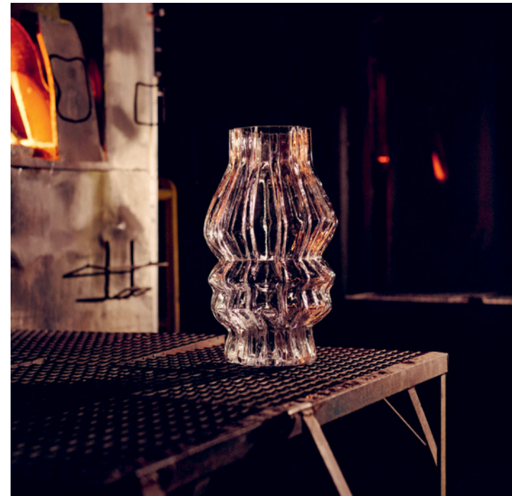
Fragrance brand BYREDO collaborated with Finnish design house IITTALA for LJUS, a line of objects designed to be used with scented candles. The candles are housed in handblown glass vessels crafted in Iittala's historic factory, creating a striking contrast between the flickering flame and the icy surfaces of the glass. byredo.com iittala.com