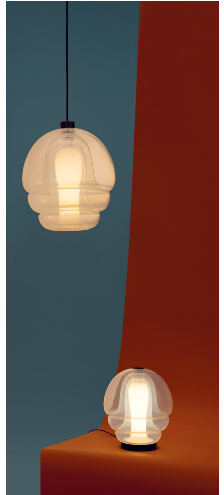
The MEDUSA lamp collection from ESTABLISHED & SONS is a contemporary reissue drawn from Carlo Nason's 1960s archives, reviving his poetic vision of the jellyfish form in layered, mouth-blown opaline glass. Born from the experimentation of Italian Modernism, the design honours the mastery of Murano glassblowing tradition while translating Nason's expressive language into a present-day context. establishedandsons.com