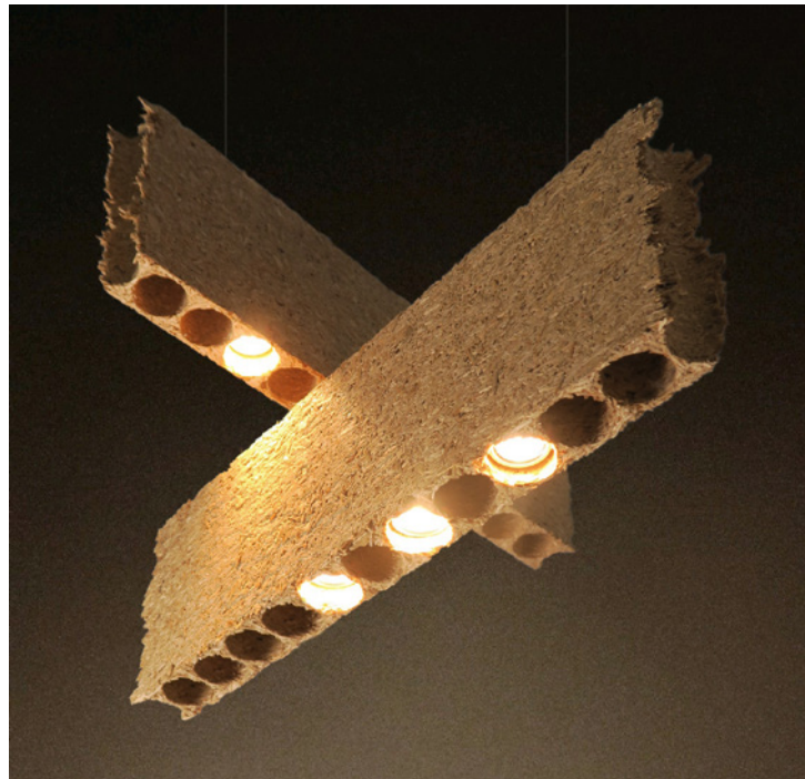
The OOOOLAMP by TOBIA ZAMBOTTI and HILDIBERG is made using waste offcuts from hollow-core particleboard doors. Spotlights are fitted into the circular holes in the offcuts, which are suspended from thin cables and arranged in layers to form a chandelier-like structure. The raw edges hint at the material's origin. tobiazambotti.com hildiberg.is