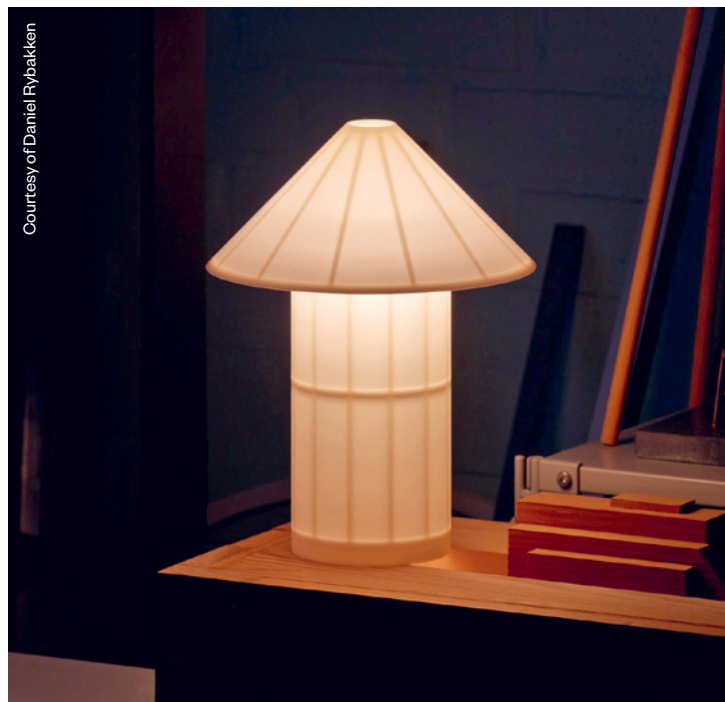
The STILLAS table lamp is designed specifically to be 3D-printed using a PRUSA RESEARCH printer and a bio-based, compostable polymer. Designer Daniel Rybakken named it after its internal structure – stillas means 'scaffolding' in Norwegian – which enables the walls to be printed so thinly that they are translucent. prusa3d.com