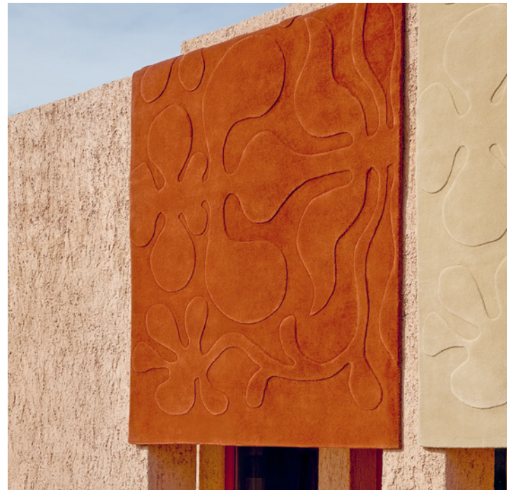
Drawing inspiration from seven original artworks by Lucia Eames, NANIMARQUINA's LUCIA EAMES COLLECTION translates the American artist's vision into a series of rugs. Playful motifs such as flowers, butterflies and tendrils are brought to life in the rugs, which are made from hand-spun Afghan wool, hand-braided jute and other premium materials by artisan communities in India and Pakistan. nanimarquina.com